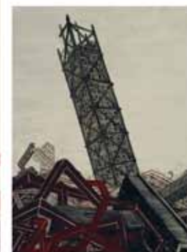
Reception: Saturday, September 22, 4:30-7:30pm