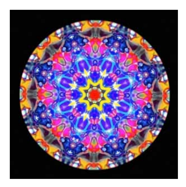
Reception: Saturday, September 22, 4:30-7:30pm